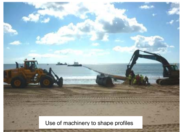
Use of machinery to shape profiles