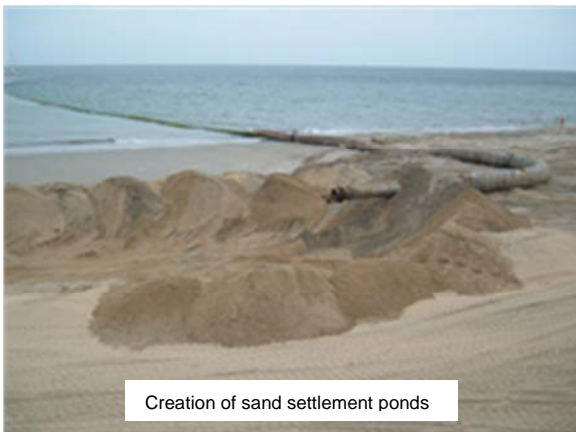
Creation of sand settlement ponds