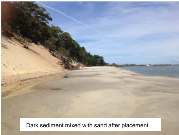
Dark sediment mixed with sand after placement