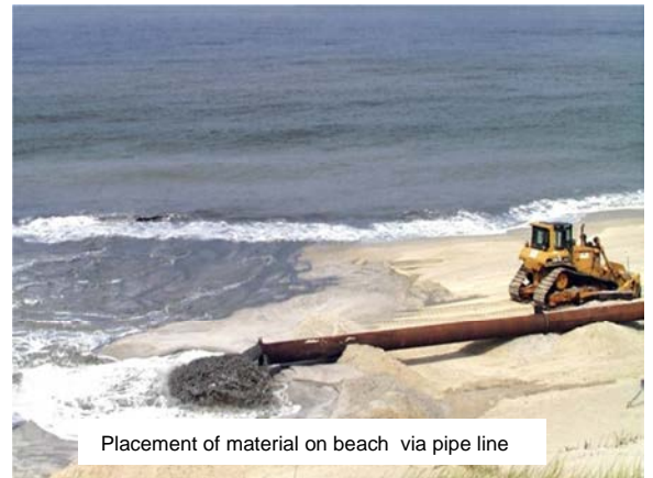
Placement of material on beach via pipe line