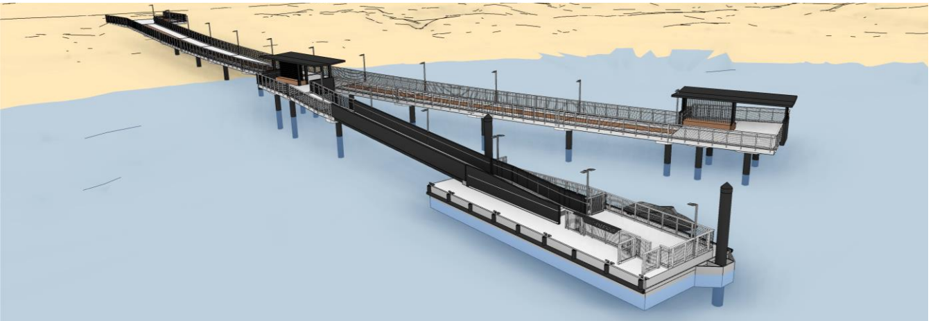
Artist's Impression of Jetty and Pontoon