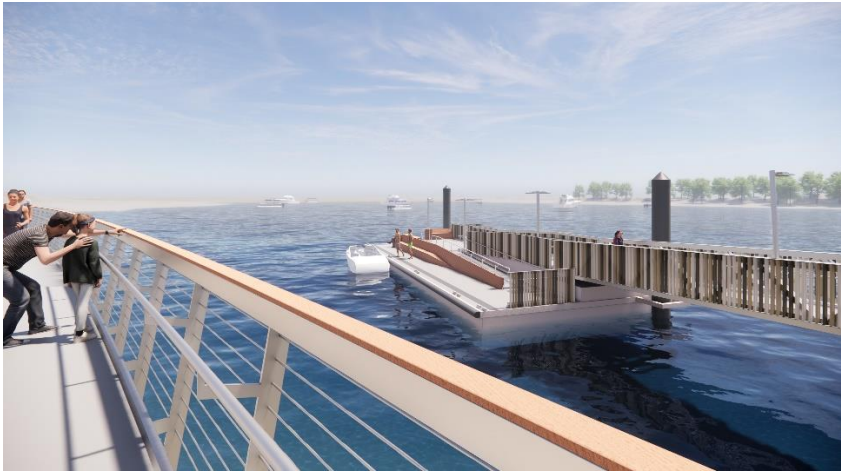
Concept images of Jetty and Pontoon