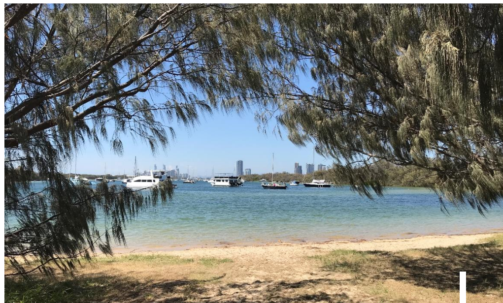
Marine Stadium, The Spit, Main Beach

Our engagement with the Gold Coast has helped define our work program and we can point to significant successes in 2018 as detailed in the following pages.