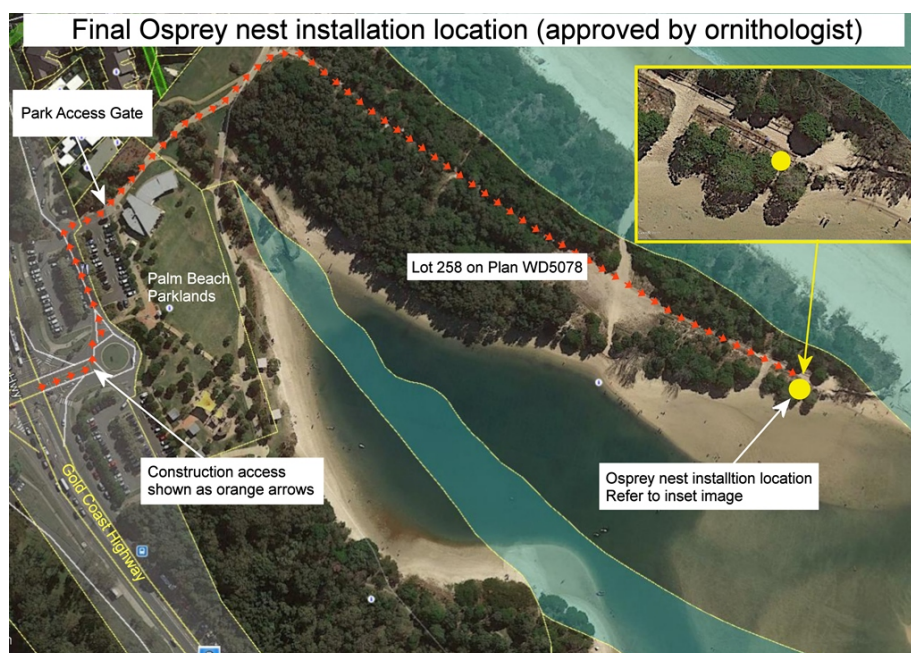
Figure 2. Nesting platform installation location and construction access